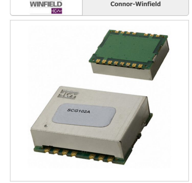
Image may be representation. See specifications for product details.