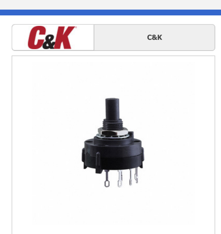
Image may be representation. See specifications for product details.