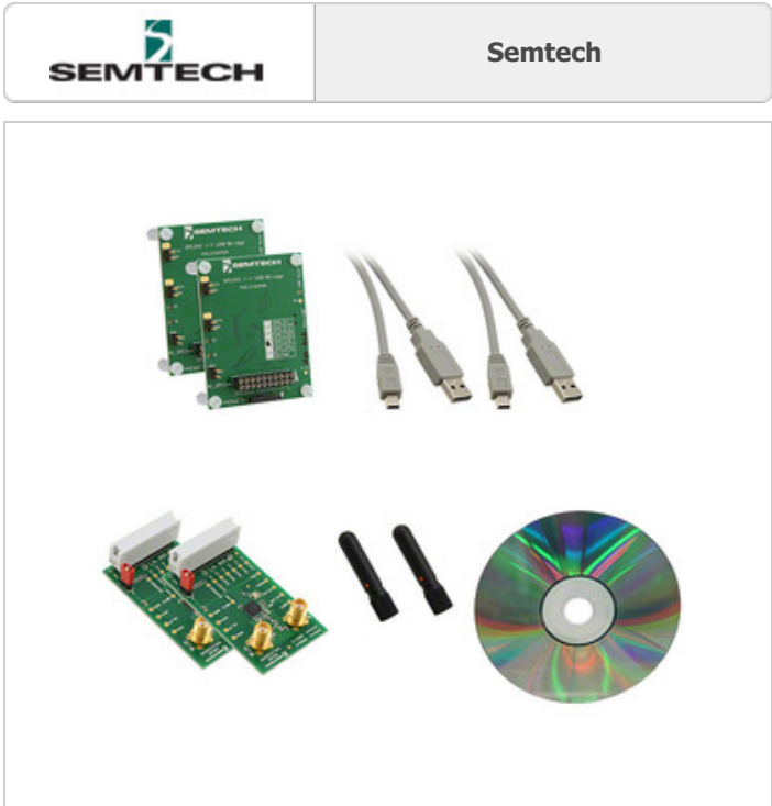
Image may be representation. See specifications for product details.