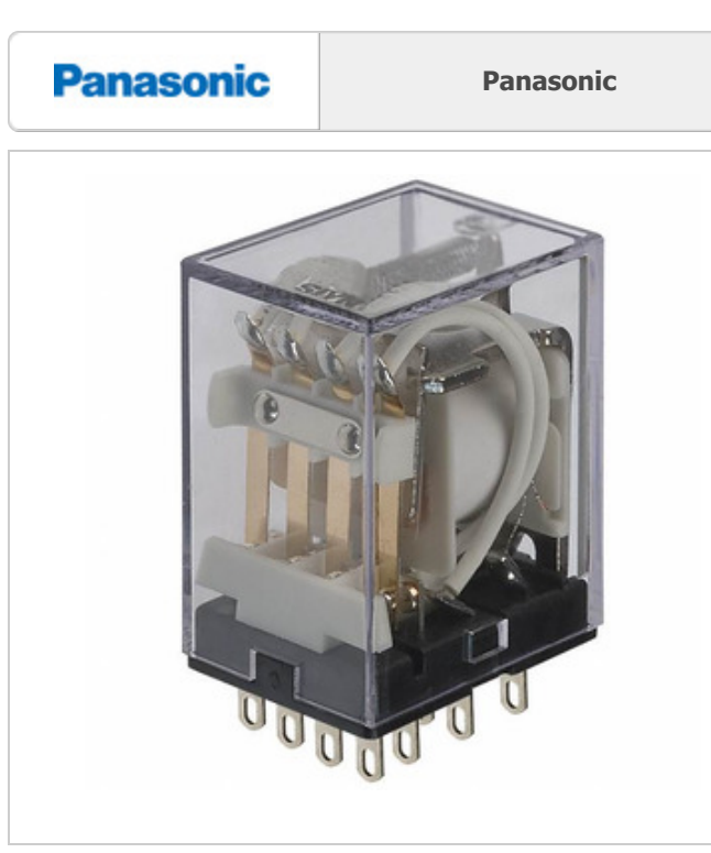
Image may be representation. See specifications for product details.