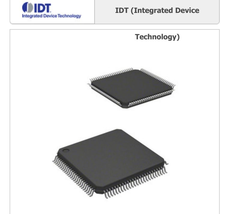
Image may be representation. See specifications for product details.