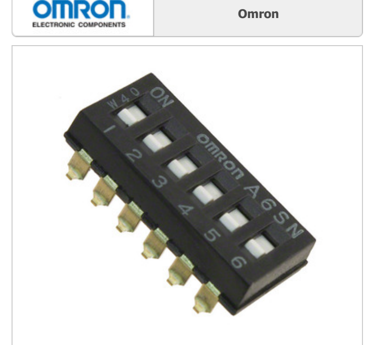
Image may be representation. See specifications for product details.