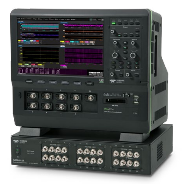
8 analog channel + 16 digital channel, 1 GHz, 12 bit resolution HDO8108 high definition oscilloscope with SAM40-24 provides 8+16+24 channel acquisition capability.

The most basic system available combines a 350 MHz, 500 MHz, or 1 GHz 12-bit resolution, 4 channel oscilloscope (HDO4000A or HDO6000A Series) with a SAM40-8 eight channel acquisition module. This triples the number of available inputs for a very modest price, and preserves high bandwidth oscilloscope inputs for the most important uses, or provides capability to view more high bandwidth signals than would have previously been possible without the SAM40. 16 and 24 channel acquisition modules may also be used. MSO oscilloscope models further add 16 digital logic input channels.