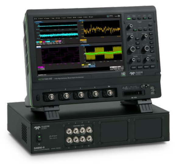
4 analog channel + 16 digital channel, 1 GHz, 12 bit resolution HDO6104A-MS high definition oscilloscope with SAM40-8 provides 4+16+8 channel acquisition capability.

Engineers commonly use multiple instruments to debug and validate complex deeply embedded control systems, mechatronics, and electro-mechanical systems. Multiple instruments report different information on different displays and in different formats. An HDO with a sensor acquisition module cost-effectively replaces multiple instruments with one consolidated view of system performance. Leverage the Teledyne LeCroy deep toolbox to perform math, measurements, pass/fail and other analysis on all acquired data, or apply an application package to gain even faster time to insight.