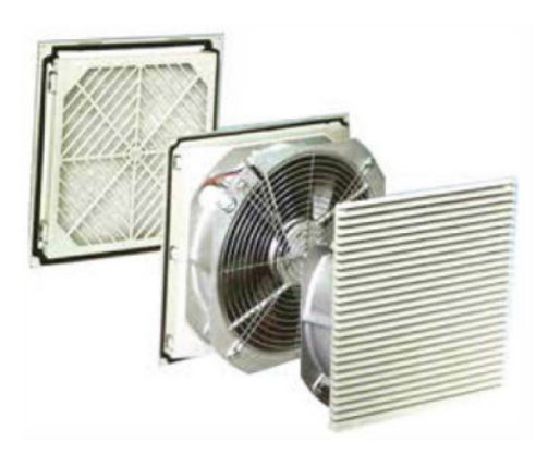
Figure 2: Typical louvered fan guard and fan with snap-on guard.