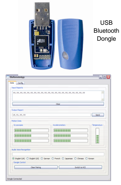
PC Software on CD-ROM