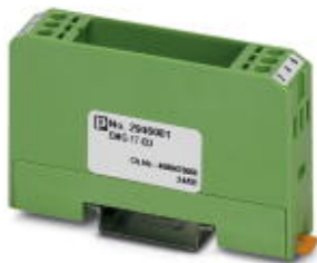
Custom circuit module, consisting of housing, MKDS 3 connection terminal blocks and PCB

Please be informed that the data shown in this PDF Document is generated from our Online Catalog. Please find the complete data in the user's documentation. Our General Terms of Use for Downloads are valid ( http://phoenixcontact.com/download )