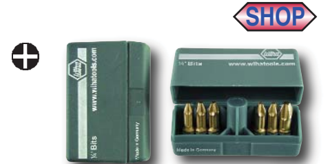
711 96 PokitPak - Phillips TiN Coated Insert Bits In Molded Case -