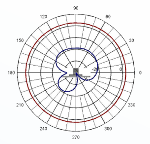
Azimuth Plane Cut perpendicular to the antenna, parallel to the connector/cable exit, perpendicular to the polarization

The omni-directional pattern is suited to a variety of uses, including handheld devices, in-building systems or other applications where mobility is a factor.