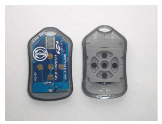
Figure 1. 4010 RKE Universal Key Fob and Plastic Case (P/N 4010-DAPB_434 and MSC-PLPB_1)