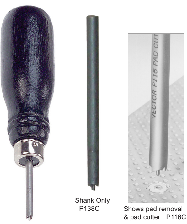
P138A - Wooden Handle type

Vector Pad Cutters provide an effective method for creating isolated solder pads around holes in copper clad boards. Pilot pin enters hole and rotates, creating a clearance area around the solder pad. Available for boards with 062" or .042" diameter holes. Also available without handles for use with manual or power drills.