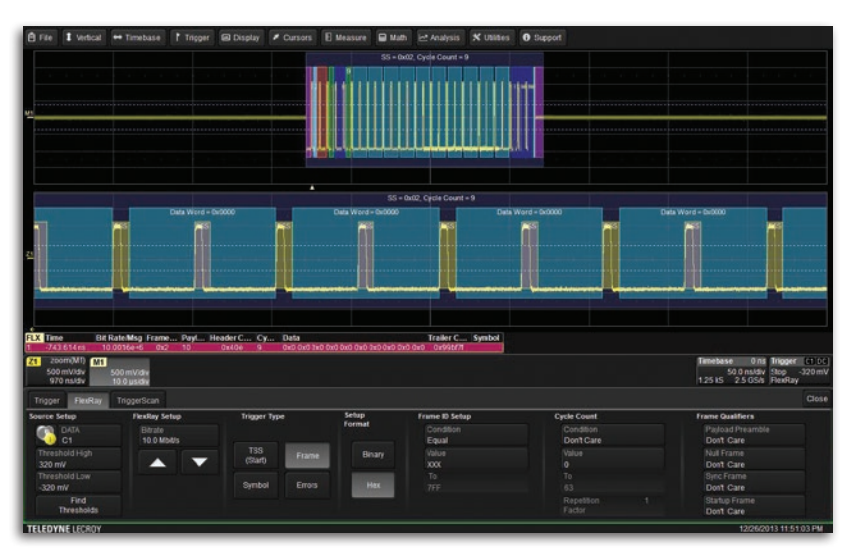
Trigger on every aspect of the FlexRay Frame as well as Symbols and Errors including FSS, BSS, FES, CRC, CID, CAS/MTS and Wakeup by selecting the appropriate boxes.

Triggering on the complex FlexRay protocol is made easy with an intuitive interface and a wide range of trigger settings for all aspects of the protocol. Set up a simple TSS (Start) symbol trigger with a single button press or trigger on any part of a FlexRay frame including ID, Cycle Count, Cycle Repetition Factor and Frame Qualifier. FlexRay defined Symbols and Errors can also be incorporated into the trigger making it as simple or advanced as necessary. Conditional triggering can be set to trigger on a range of Frame IDs or Cycles.