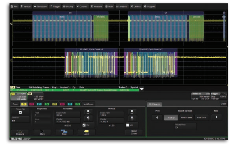
Search through long record of decoded data by entering the message or address you are looking for and clicking the right or left search arrows.

ID or Data values can be quickly located by searching for a specific value. In a long acquisition, pressing NEXT advances the single byte to the byte right or left of the current message.