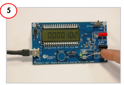
Touch thermocouple and monitor voltage displayed on LCD.

Press the source button to toggle between voltage inputs (Thermocouple and test leads).