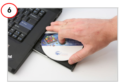
Refer to the Kit Guide for project files.