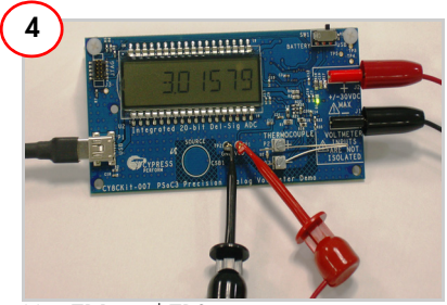
Use TP1 and TP2 test points to measure kit power source.

Connect the test leads. CAUTION The input range is limited to -30V DC to +30V DC DO NOT use AC voltage.