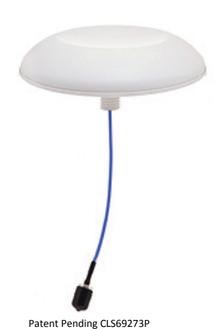
STANDARD CEILING MOUNT