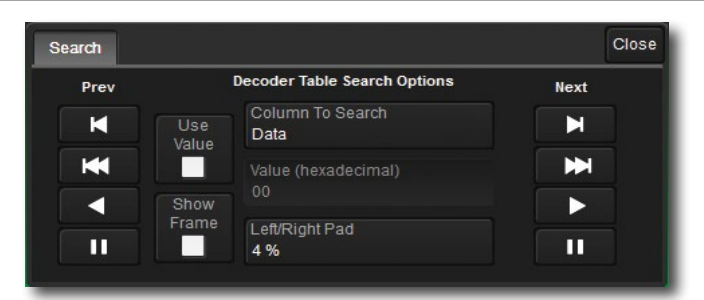
Search through long records of decoded data by entering specific message or frame details.

Search through long records of decoded CAN data for specific Frame IDs, data values, frame types or status bits.