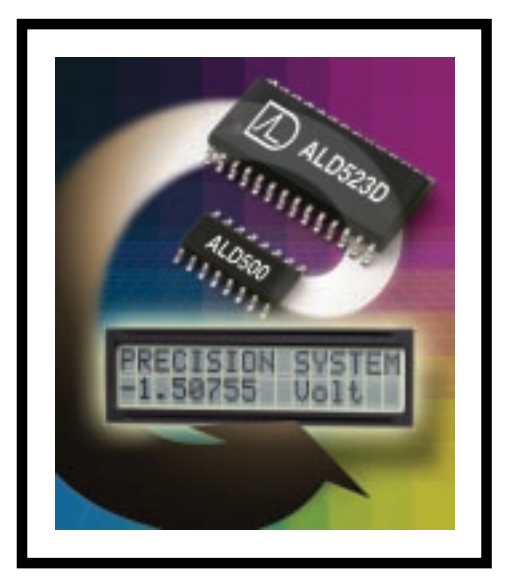
Chipset consisting of ALD500 Integrating Analog Processor and ALD523D Display Module Controller

In addition to the three modes of operation, up to three separate display group settings are available, each with different scale factors and UNIT displays. For applications such as embedded measurement instrument modules, up to three separate ranges of a single measurement can be preset, selected and displayed. Both software and hardware based settings are available for setting a variety of parameters such as Samples Averaging, Decimal Placement, Digits Blanking, Zero Level, Display Group Setting, Mode Selection, UNIT Labeling, and Calibration.