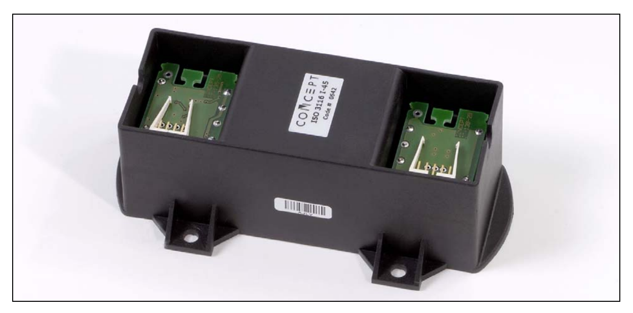
Fig. 1 Power Supply ISO3116I

For drivers adapted to various types of high-power and high-voltage IGBT modules, refer to <a href="https://www.IGBT-Driver.com/go/plug-and-play">www.IGBT-Driver.com/go/plug-and-play</a>