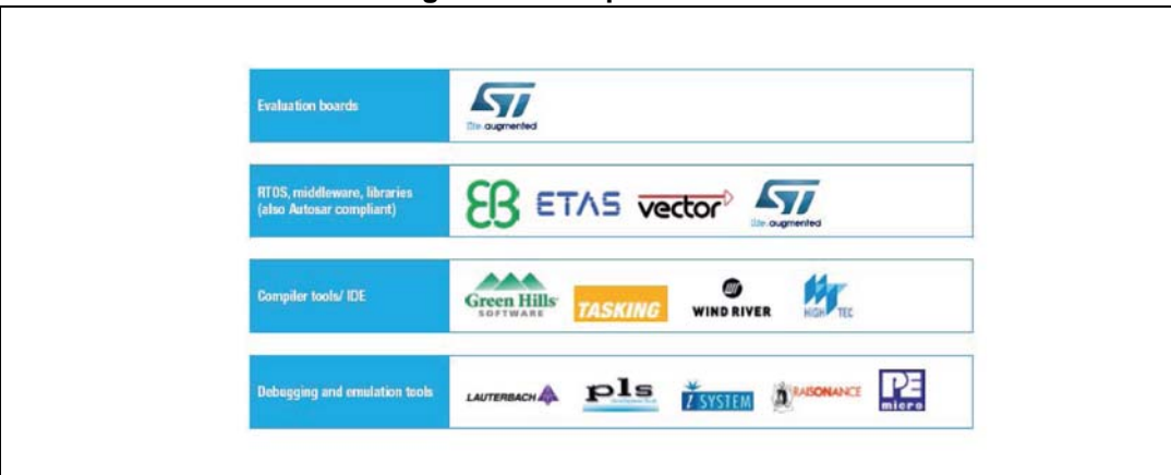
Figure 2. Third parties tools

A set of ST and third parties tools are available to explore the product family starting from budgetary cost evaluation boards to top class solutions.