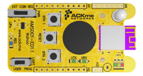
Wahoo Evaluation Board

ACKme Networks offers a range of industry leading cloud-connected wireless communication modules including Wi-Fi, Bluetooth, Bluetooth Low Energy and GPRS cellular. ACKme is headquartered in Silicon Valley, USA with a design centre in Sydney, Australia and a range of international distributors.