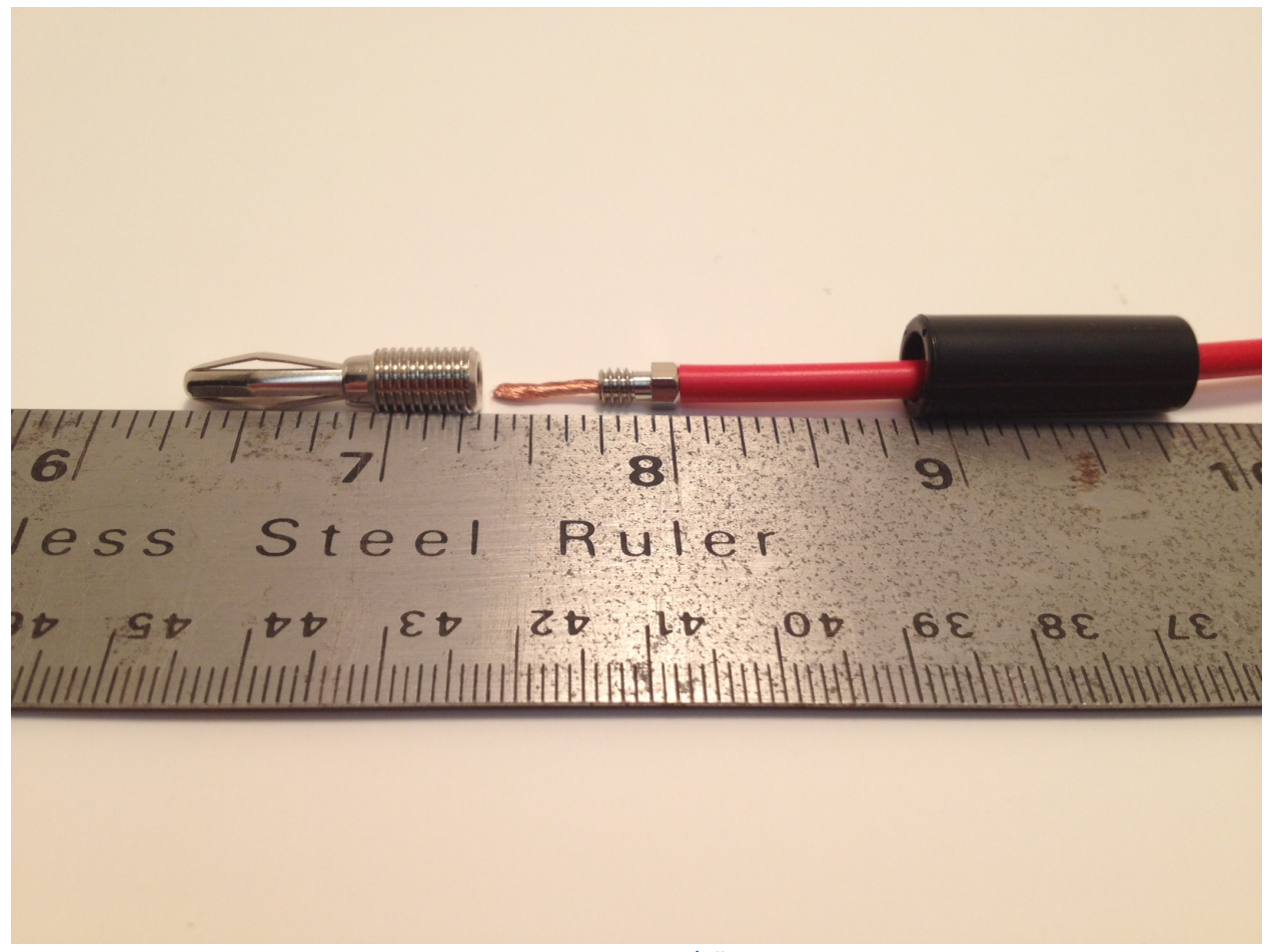
For an 18 awg wire you will need to strip the item back 5/8". Push the wire into the assembly hold the small nut against the insulation and screw it into the banana. Finally pull the insulating cover over the banana and screw in. If your using a smaller gauge wire, you will need to increase your strip length.