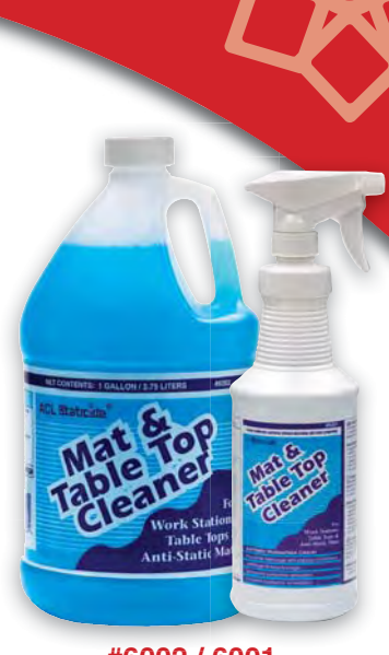
#6002 / 6001