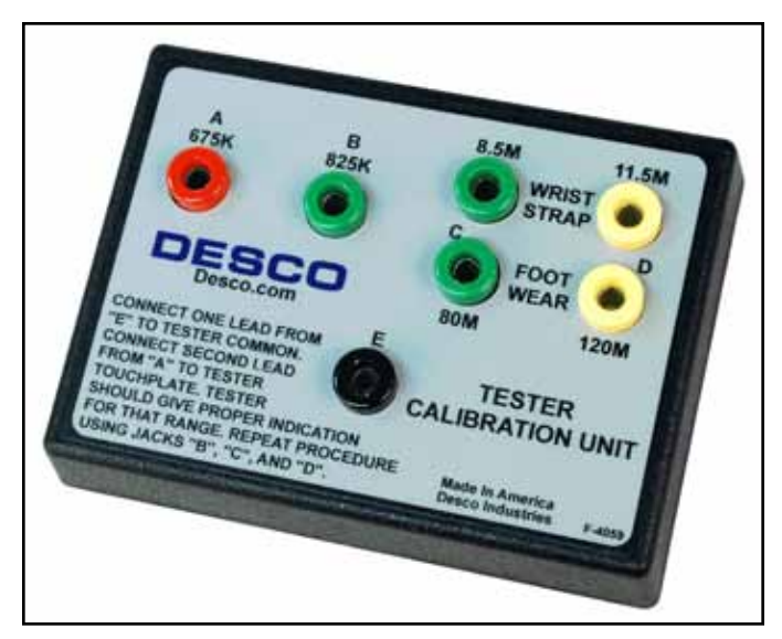
Figure 3. Desco <u>07010</u> Calibration Unit

View technical bulletin TB-2039 for more information on the 07010 Calibration Unit and instructions to calibrate the Wrist Strap Tester.