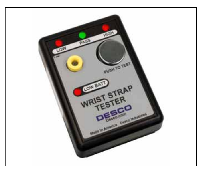
Figure 1. Desco 19240 Wrist Strap Tester