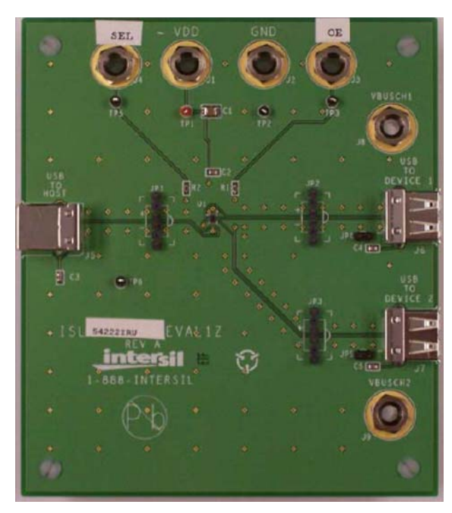
FIGURE 1. ISL54222AIRUEVAL1Z EVALUATION BOARD