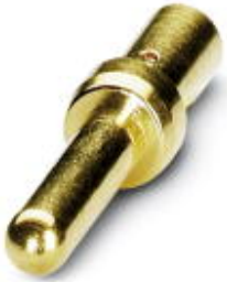
Crimp contact, turned, Contact diameter: 2 mm, Crimp range: 0.75 mm 2 ...1 mm 2

Please be informed that the data shown in this PDF Document is generated from our Online Catalog. Please find the complete data in the user's documentation. Our General Terms of Use for Downloads are valid ( http://phoenixcontact.com/download )