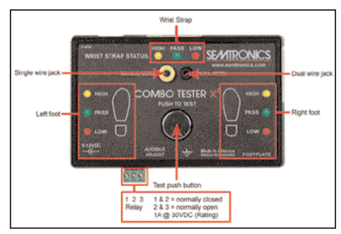
Figure 3. Dual Independent Footwear and Wrist Strap Tester features and components