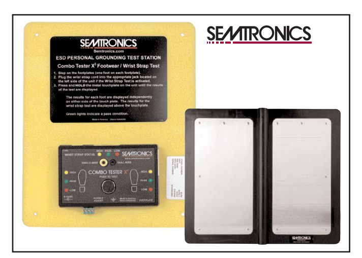
Figure 1. Semtronics Dual Independent Footwear and Wrist Strap Tester (EN752) and Dual Foot Plate