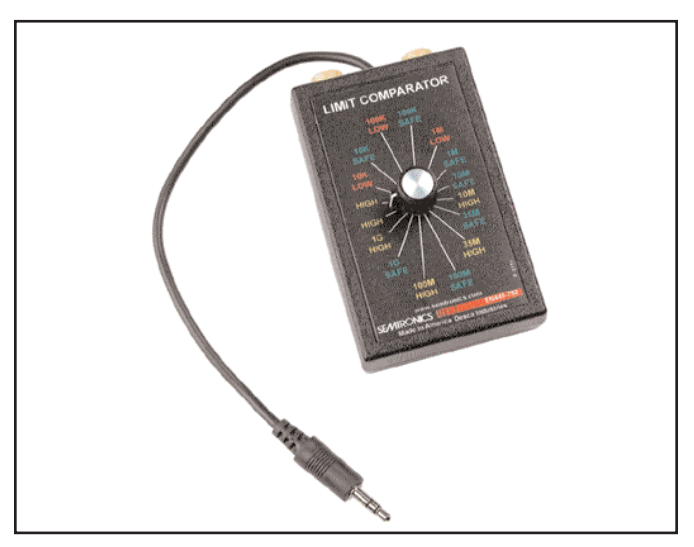
Figure 4. Semtronics 62080 Limit Comparator

The Semtronics Limit Comparator allows the customer to perform NIST traceable calibration on a number of Semtronics Testers including the 62101, 62102, and 62104. The Limit Comparator can be used on the shop floor within a few minutes virtually eliminating downtime, verifying that