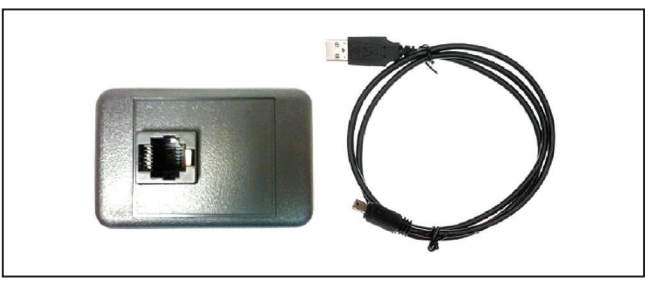
Figure 2. DS9481R-3C7 1-Wire USB Adapter with USB Cable

Ordering Information appears at end of data sheet.