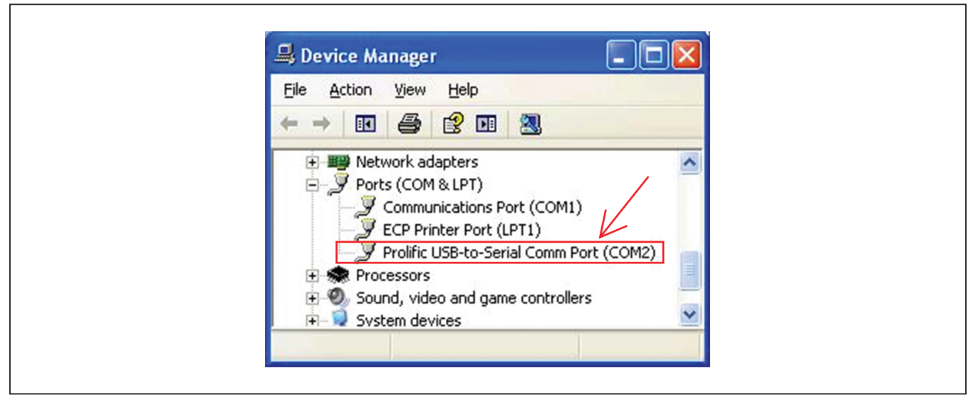
Figure 3. DS9481R-3C7 COM Port

After downloading the software from the URLs listed in the previous <u>Quick Start</u> section, and unzipping and saving the files to a folder, start the EV kit software by double-clicking the file DS28E05_Evaluation_Program. exe .